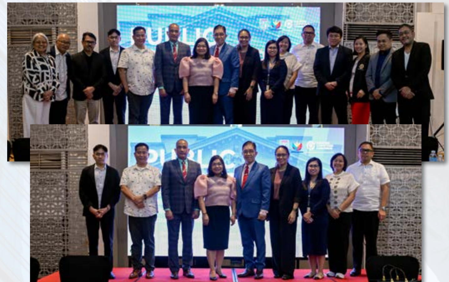
Members of the TWG from the PCC, LEB, and UP CLPP with representatives from various legal education institutions during a public consultation on the proposed specialized academic track and post-graduate certificate program in competition law held on December 2.