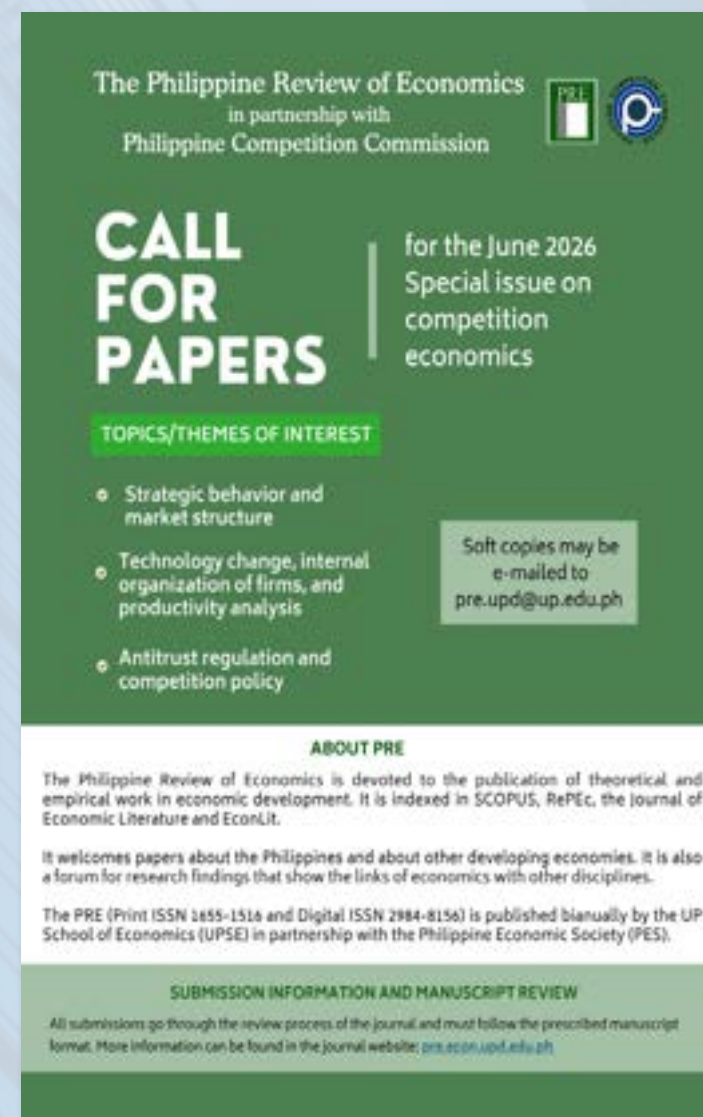
The PCC announced a call for papers for the special issue on competition economics and regulation, in partnership with the PRE.