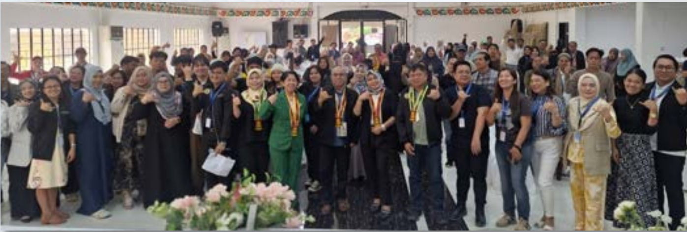
Stakeholders across the country received competition law and policy training from PCC's partner SUCs, including Bukidnon State University (top left), University of Eastern Philippines (top right), and Mindanao State University (bottom).